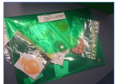
Extra items ready to use